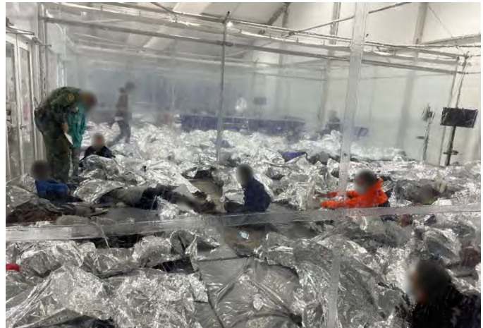
More overcrowded pods at the Donna, Texas facility