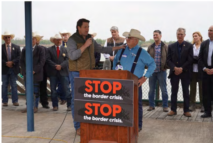
Rep. Arrington speaks with a local rancher about the increase in violence at the border