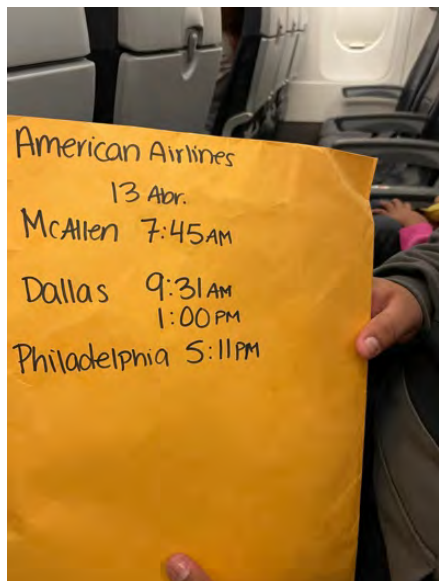
Above: Packet given to illegal immigrants with taxpayer funded plane tickets into the interior of the country

Cartel Activity: Cartels have scouts constantly monitoring Texas DPS and CBP law enforcement. During a night ride along with Texas DPS Special Operations Group, suspected smugglers were using music to signal law enforcement movements along the brush. Texas DPS has also discovered TikTok videos showing armed cartel members monitoring U.S. law enforcement.