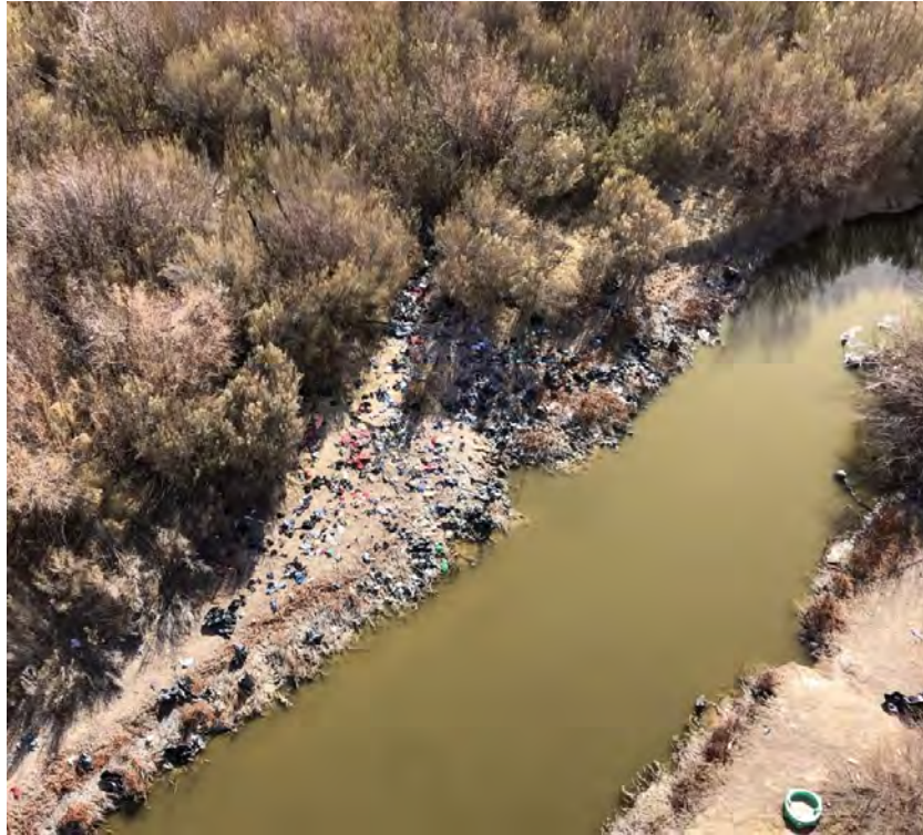
Aerial photo of litter left behind from migrants as they cross illegally into the United States

“It’s more than a crisis, this is a human heartbreak,” said Republican Leader McCarthy.