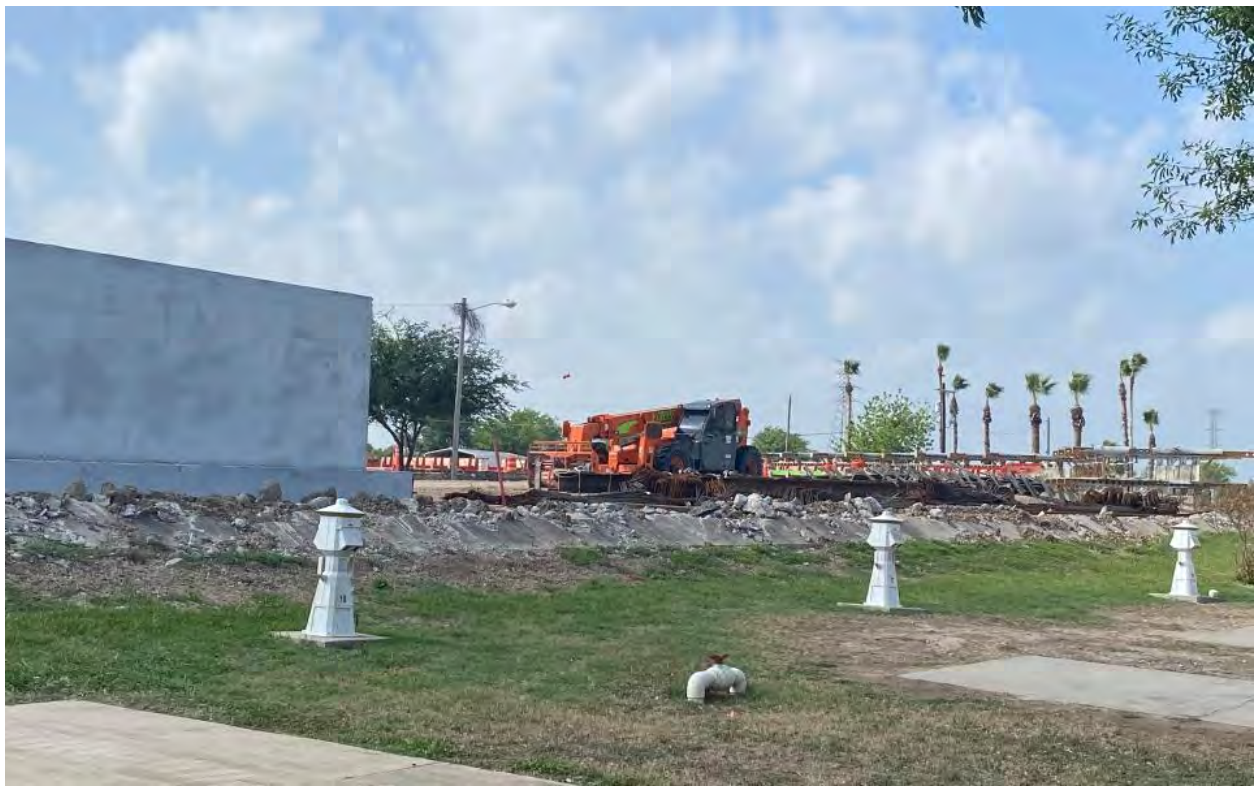
Unfinished portions of the border wall with equipment and materials rusting away

“During my visit to Texas this month I got a first-hand look at the chaotic situation that is spiraling out of control on America’s southern border. I saw temporary detention spaces designed to hold a few hundred people holding thousands. I saw a makeshift processing center under a bridge, crammed with hundreds of illegal aliens wrapped in “space blankets” that reminded me of the livestock pens I saw growing up on a farm in Wisconsin. At both sites, fully loaded tour buses arrived one after another to drop off a never-ending stream of migrants.” - Rep. Tom Tiffany (WI-7)