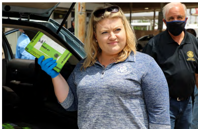
Rep. Kat Cammack holds confiscated illegal drugs captured at the border.

Walls Work: In places where the border wall system was built in the RGV sector, Border Patrol relayed that they were able to gain operational control of the border. The wall system shifted 80% of illicit activity away from areas where it was constructed to areas without physical barriers. Because the Biden Administration suspended wall construction, large amounts of rebar and building materials are currently scattered across communities. In one neighborhood, a road was fully deconstructed and has yet to be repaired.