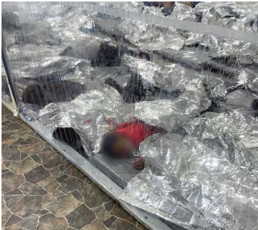
Children in an overcrowded pod in Donna, Texas

Pods at this facility in Donna, Texas currently have ten times the number of people they were designed to hold. viii According to CBP the current Covid positive rate is 10%. ix