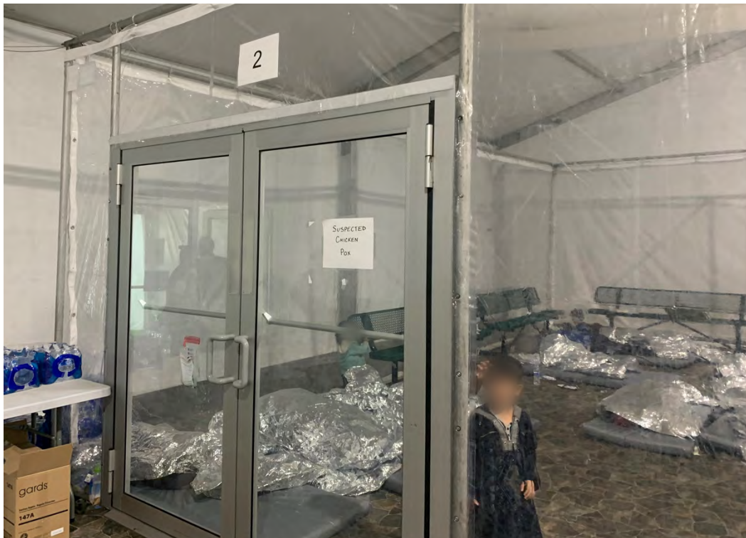
Below: Children with suspected Chicken Pox placed into one cell

“We were the first CODEL to the Delphi Long-Term Care Site. Our border patrol is doing the best they can, but they’ve been overwhelmed trying to do jobs they haven’t been fully trained for and didn’t sign up for. The site had seen cases of lice, scabies, meningitis, chicken pox, and flu of unknown origin.