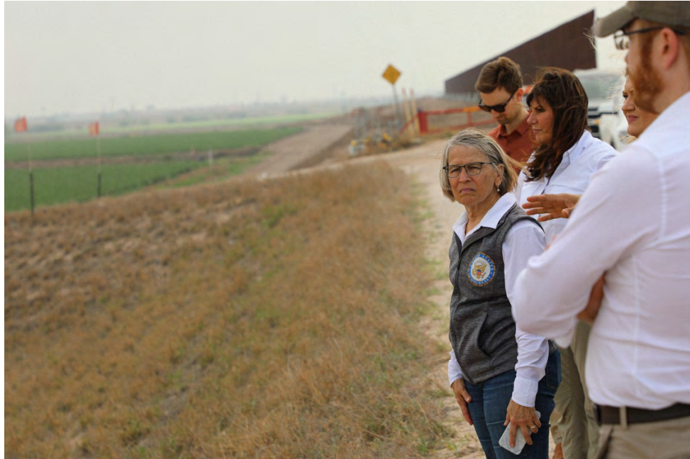
Rep. Mariannette Miller-Meeks and other members of the delegation inspect unfinished portions of the border wall

“Nothing goes through the border without the knowledge of the cartels. They have had children as young as one-year-old dropped off at the gate with a phone number written on paper pinned to their shirt or written on their shirt (with) a marker.