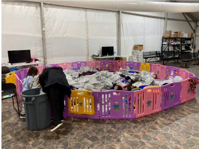
Children being held in a makeshift enclosure at Donna Processing Facility

“The Customs and Border Protection holding facility in Donna, Texas, was packed with unaccompanied children. The older children slept on the hard ground behind plastic dividers. Fundamentally, stacked on top of each other with barely enough room to move around. The younger children were lying in a pink and purple play pen with no comforts that a child should enjoy... You can’t truly understand what’s happening at the border until you visit and see it for yourself. The conditions are abysmal. It is a humanitarian and national security crisis and to see the Biden Administration blatantly ignore what’s going on, is simply a dereliction of duty. ” – Rep. John Carter (TX-31)