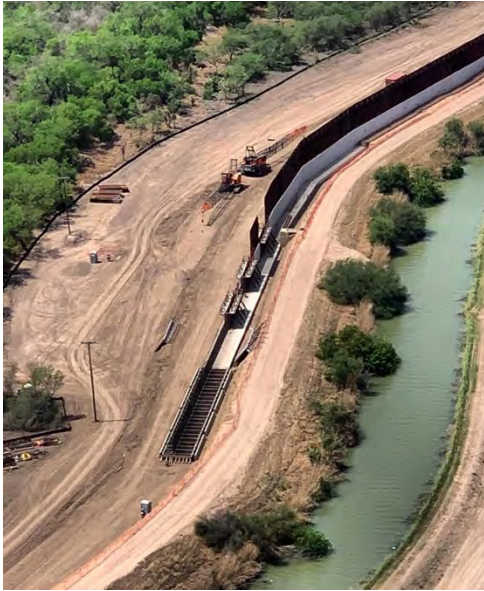
Unfinished wall abruptly stopped on January 20th

“With 35 percent of Border Patrol officers no longer manning their regular posts and instead tending to migrants in facilities like the one we visited in Eagle Pass, there are now major vulnerabilities along our border where we need boots on the ground to manage the surge. Law enforcement and Border Patrol officers told me that they are completely overwhelmed and are not currently equipped to handle the emboldened cartels and traffickers who are exploiting the security gaps at the border. They are not only seeing significant increases in illegal crossings but in violent encounters, human trafficking, and drug smuggling. To fix this crisis, the Administration should immediately end catch and release and re-start construction of our border wall. Until this situation is addressed, every state is a border state. ” – Rep. Ashley Hinson (IA-1)