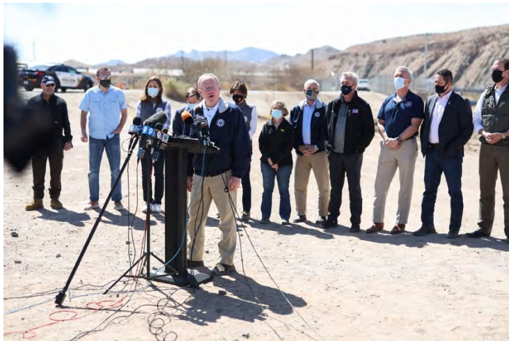
Rep. John Rose speaks to reporters following meetings with border agents

“You can fix this thing, working with us. If America is paying attention, and I believe they are, your phone is going to start ringing. I implore you, good sir. Let us in. We can fix this thing. It’s beyond a crisis at the border. It’s a threat to our Republic. And you, Mr. President, have a responsibility to listen to the citizens that we serve.” – Rep. Clay Higgins (LA-3)