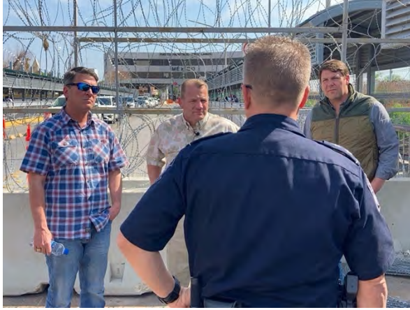
From Left to Right: Rep. Jackson, Rep. Troy Nehls, and Rep. Arrington speak with a law enforcement officer at the border with Mexico

“Cartels are profiting from the exploitation of vulnerable families by charging them to get their children into America illegally, putting the children in grave danger. We have already seen deeply troubling evidence of what this looks like. Smugglers dropped two small children off of the 14-foot border wall in New Mexico, a brave Texas Department of Public Safety (DPS) officer saved a drowning baby who was thrown off a raft