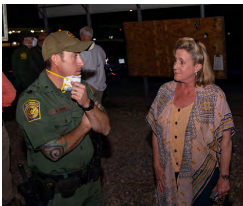
Rep. Ann Wagner meets with Border Patrol Agents

“During my time at the border, I spoke to Border Patrol agents who need our help and who need us to build the wall and secure the border. We have to go back to strong immigration policies that deter illegal immigration and prevent people from making the dangerous trek across the border. Our facilities have been overwhelmed by the surge of illegal immigrants, and too many children and families are living in unacceptable conditions because they are so full. ” – Rep. Ann Wagner (MO-2)