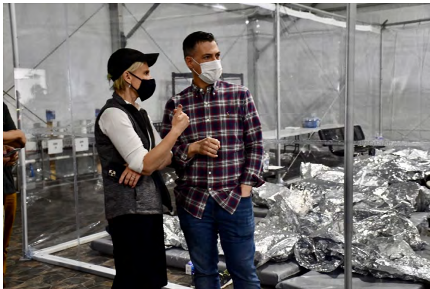
Rep. Victoria Spartz & Rep. Jim Banks inspect a crowded holding facility

Attendees: RSC Chairman Jim Banks (IN-3), Tony Gonzales (TX-23), Kelly Armstrong (ND-AL), Kevin Hern (OK-1), Ashley Hinson (IA-1), Chris Jacobs (NY-27), Lloyd Smucker (PA-11), Victoria Spartz (IN-5)