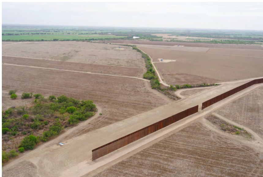
This aerial view shows gaping holes in the border wall

“We heard from a number of ranchers along our southern border who fear for their safety and that of their families as well as the ability to keep operations productive while enduring the threat and presence of the cartel who monitor their every move. Those crossing on the New Mexico border are not generally those seeking asylum. Rather, they are aiming to enter our nation illegally and undetected, by any means necessary. It was jarring to learn of the amount of property damage, stolen vehicles, downed fences, and broken water lines among other impacts of this crisis on cattle and other livestock. Ranchers on the southern border are unable to let their children play alone outside at any time of the day or night because of the danger the migrants pose. The vast majority of those crossing in this area are in camouflage and do not want to be detected. They pose a significant threat to anyone who crosses their paths. Moreover, the ranchers feel they have no recourse for the loss of property, livestock, and livelihoods.” – Rep. Yvette Herrell (NM-2)