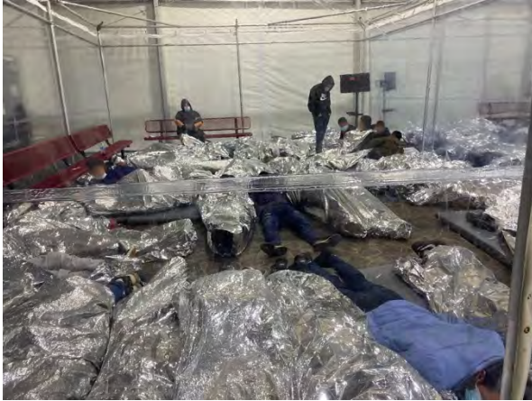
Left: Overcrowded holding cell at a processing facility in Donna, Texas

Attendees: Brad Wenstrup (OH-2), Greg Murphy (NC-3), Larry Buschon (IN-8), Buddy Carter (GA-1), Rick Crawford (AR-1)