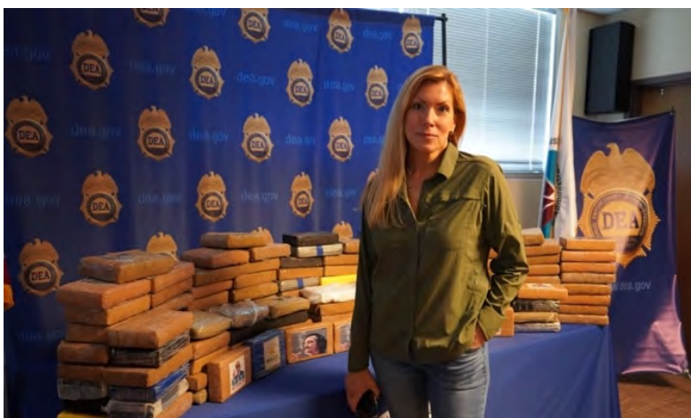
Rep. Beth Van Duyne poses with illegal drugs seized by CBP agents at the border

Congresswoman Beth Van Duyne spoke with DEA agents while at the border with Rep. Arrington and other members of the Texas delegation at the end of March and saw some of the drugs that were being seized. Congresswoman Van Duyne also observed the conditions at a processing facility in Donna, Texas.