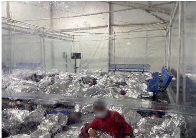
The Donna Facility is designed to hold 250, at the time of this photo it was holding nearly 4,000 people