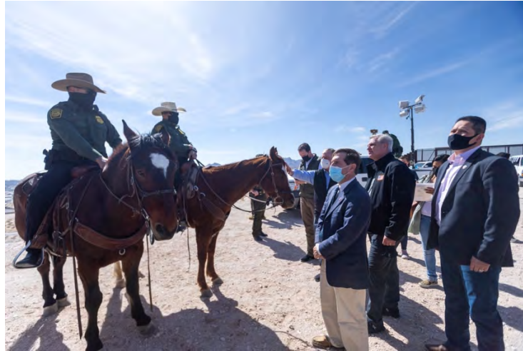
Members of the delegation meet with Customs and Border Protection Agents

“Today, I joined Republican Leader Kevin McCarthy and some of my Republican colleagues on the southern border. I can tell you first hand, that what we are seeing is a humanitarian crisis of a tremendous scale.... The long-term effects of this crisis will be devastating for our nation if we do not act immediately.” – Rep. Chuck Fleishman (TN-3)