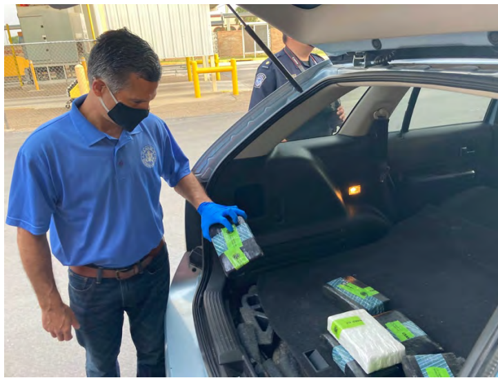
Rep. Dan Meuser inspects confiscated illegal drugs seized by CBP agents at the southern border

I traveled to the Mexican border with members of the Problem Solvers Caucus to speak with Customs and Border Protection agents in McAllen, Texas. I visited several migrant processing facilities and joined Operation Lone Star on patrol on the Rio Grande. It is overtly evident that the recent policy changes from President Biden created incentives for this mass amount of illegal immigrants, primarily from the northern triangle of Central America. These perceived incentives need to be corrected and we must provide CBP all that is necessary to increase border security and help bring this crisis to an end. I hope we can engage in a bipartisan effort to rectify this situation.” – Rep. Dan Meuser (PA-9)