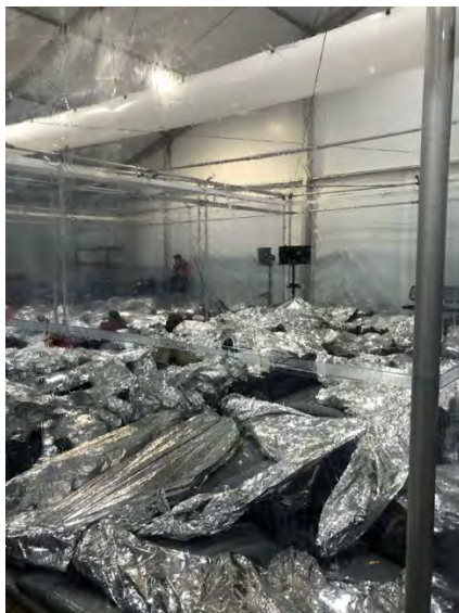
Another view of an overcrowded holding cell in Donna, Texas

“Our southern border has seen an out-of-control surge of migrants in recent weeks, overwhelming migrant holding facilities. In one case, a CBP facility is holding at 1600% of its holding capacity. In February alone, nearly 100,000 illegal immigrants were detained by law enforcement. In March, that number was 172,000, including nearly 19,000 unaccompanied teens and children. CBP and Texas state troopers have had to redirect some of their focus to operating and maintaining migrant holding facilities instead of engaging in their typical border protection efforts of combating drug smuggling, human trafficking, and other criminal activities of drug cartels and other criminal organizations. This puts our national security at risk. ” x – Rep Rodney Davis (IL-13)