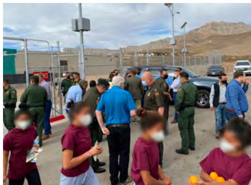
Members meet with CBP agents at a processing facility in El Paso, Texas

Border Patrol agents on the ground described facilities being overwhelmed by the surge of illegal immigrants. The sheer number of unaccompanied children alone has forced the agency to divert operational resources away from strengthening border enforcement. Border Patrol agents emphasized the importance of policy-driven solutions to stem the flow of migrants and noted President Biden’s decision to end the Migrant Protection Protocols is fueling the crisis. xii