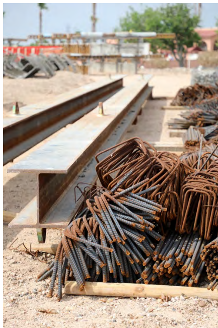
Rusting material that was being used to build the border wall