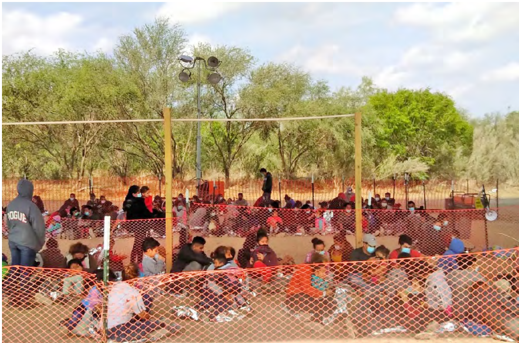
Temporary Outdoor Processing Site under the Anzalduas Bridge

This delegation heard from the (station) Chief that so far this fiscal year, the aliens that Border Patrol has apprehended crossing illegally into the U.S have included 951 aliens with criminal convictions in the U.S., 102 sex offenders, 63 gang members, and 19 aliens who potentially pose a national security risk to the United States or its interests. The delegation met with a Border Patrol agent who led the effort to construct the Temporary Outdoor Processing Site under the Anzalduas Bridge on January 23, 2021, in an attempt to more quickly process the growing number of family units encountered walking from the Rio Grande River.