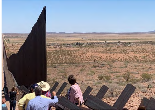
Rep. Yvette Herrell inspects unfinished portions of the border wall

“We heard from a number of ranchers along our southern border who fear for their safety and that of their families as well as the ability to keep operations productive while enduring the threat and presence of the cartel who monitor their every move. Those crossing on the New Mexico border are not generally those seeking asylum. Rather, they are aiming to enter our nation illegally and undetected, by any means necessary. It was jarring to learn of the amount of property damage, stolen vehicles, downed fences, and broken water lines among other impacts of this crisis on cattle and other livestock. Ranchers on the southern border are unable to let their children play alone outside at any time of the day or night because of the danger the migrants pose. The vast majority of those crossing in this area are in camouflage and do not want to be detected. They pose a significant threat to anyone who crosses their paths. Moreover, the ranchers feel they have no recourse for the loss of property, livestock, and livelihoods.” – Rep. Yvette Herrell (NM-2)