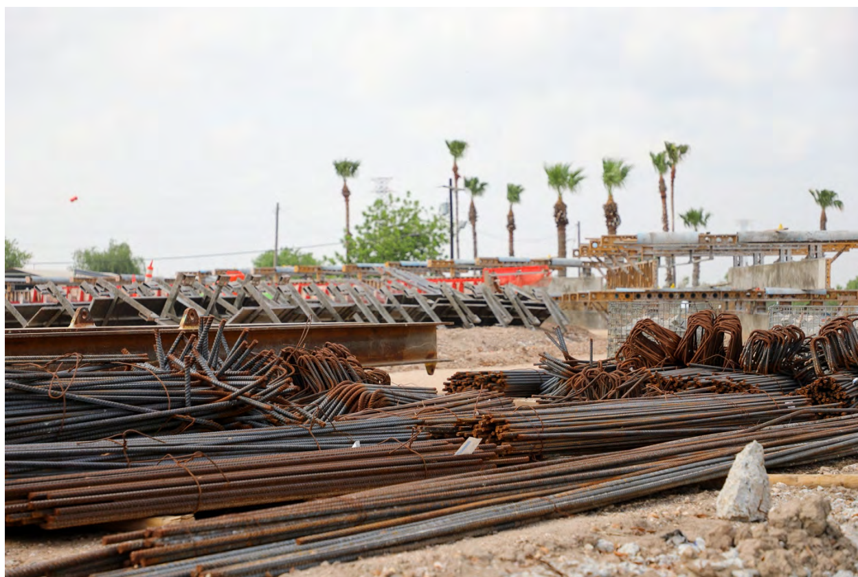
Border wall materials left to rust in the elements

The delegation toured the Donna Processing facility and saw firsthand pods that were built to accommodate 33 individuals under COVID protocols but currently held over 500 women and children. While at the Donna facility, the delegation heard that Border Patrol agents are seeing a marked increase in the number of special needs children being left alone on the U.S. side of the border. The delegation saw one young girl who was severely autistic and had been in CBP custody at Donna for 11 days because HHS did not have a facility that could house her.