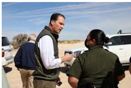
Rep. August Pfluger speaks with border patrol

“The United States is a nation of immigrants, and most immigrants are here legally. However, there's little question that Biden’s failed immigration policies are undermining America's border security efforts and exacerbating the growing surge of illegal immigrants at our southern border. What's happening here is more than a crisis. It's a scandal and it's at the feet of President Joe Biden. Border agents continue to be overwhelmed with reports indicating that border crossings are up to 6,000 per day. This is on top of the numbers from March that demonstrate how dire the situation is with 172,331 migrants taken into custody, 19,000 of which were unaccompanied minors. ” – Rep. John Rose (TN-6)