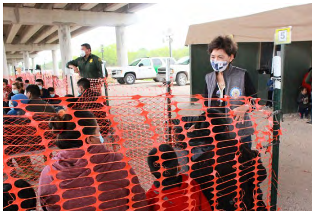
Rep. Young Kim speaks with detained migrants

“...seeing families risk their lives in the perilous journey to the U.S. breaks my heart. We saw firsthand how criminal organizations are taking advantage of these migrants. We must secure our border & create an immigration system that is fair & considerate.” – Rep. Young Kim (CA-39)